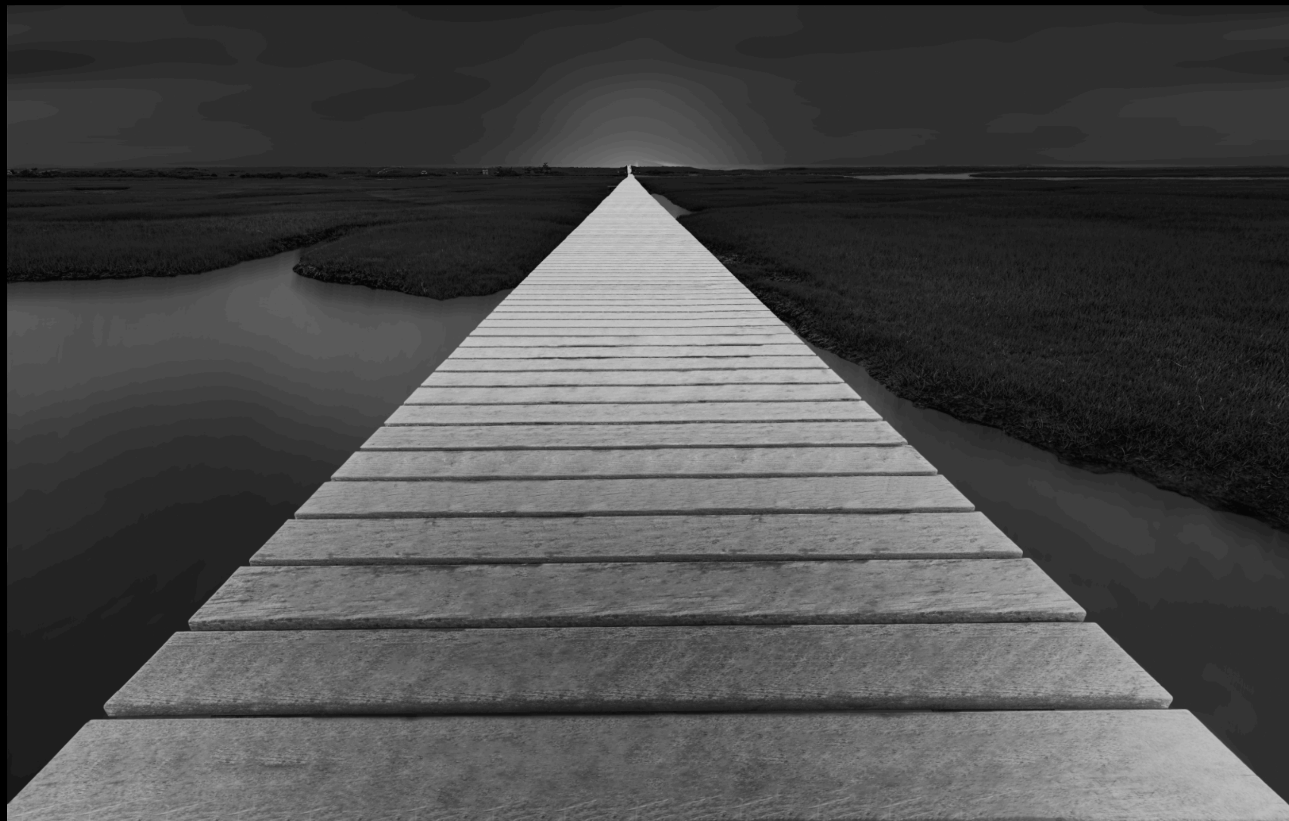
Dominic Vecchione, Boardwalk