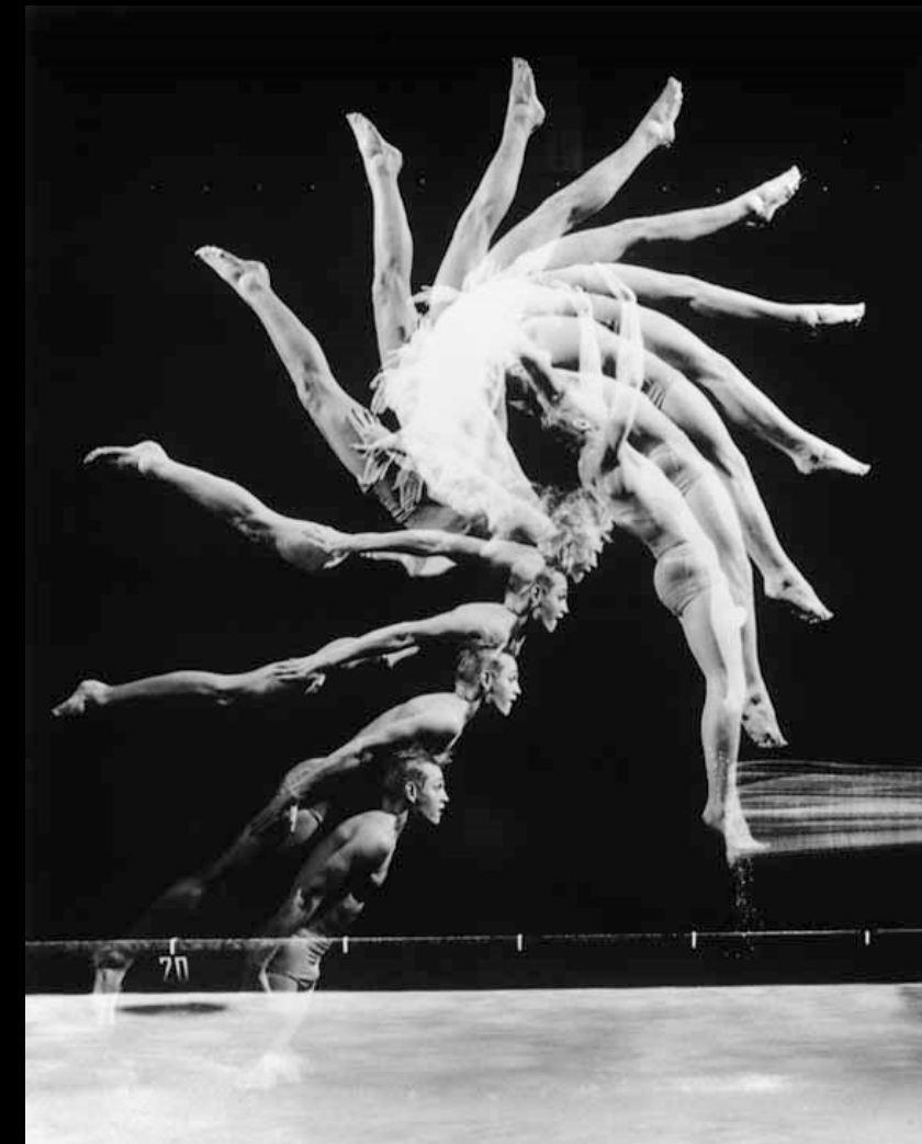
Harold 'Doc' Edgerton 1903-1990