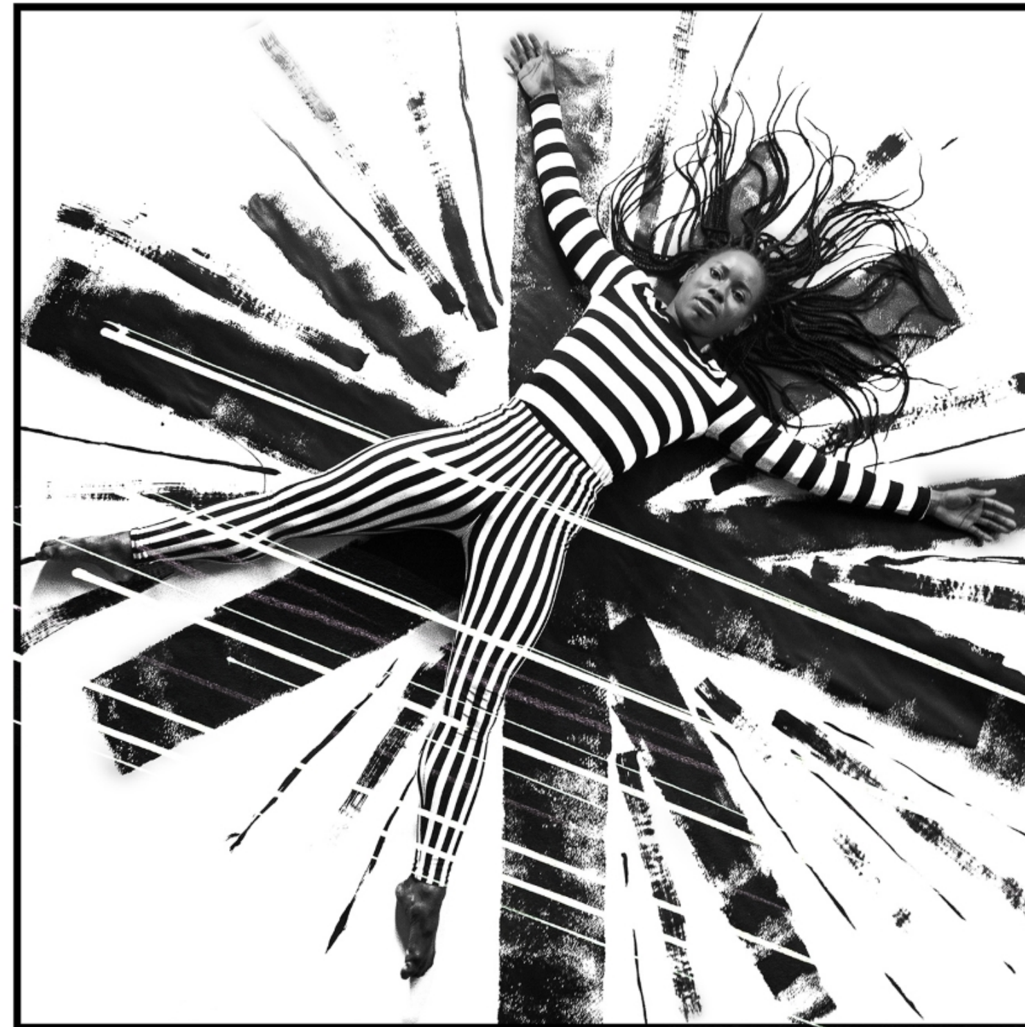
Lou Jones, Black/White