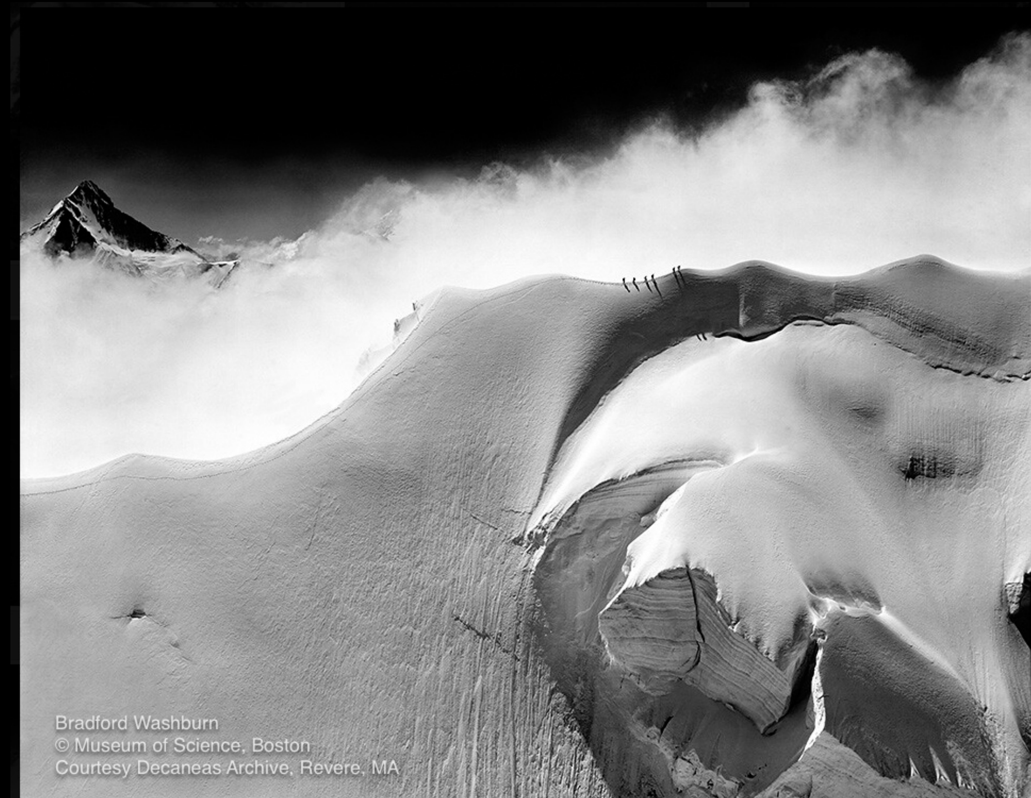
Bradford Washburn After the Storm, Climbers on the Doldenhorn, Switzerland, 1960