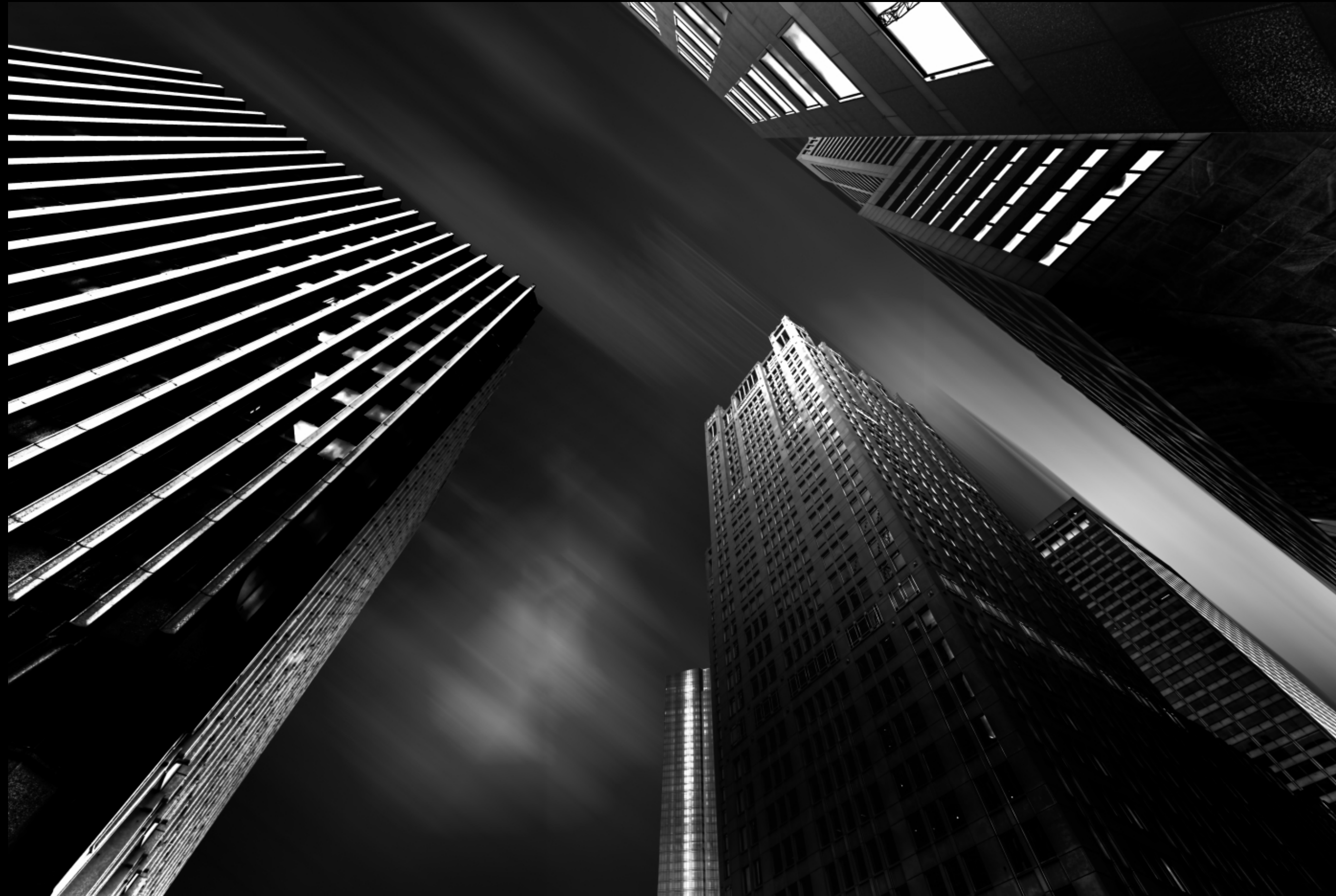
High-Rise Buildings Dominic Vecchione