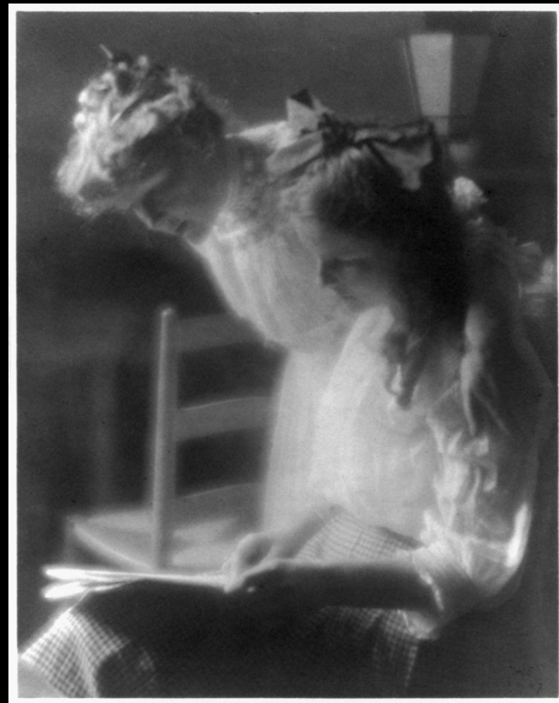
F Holland Day 1864-1933