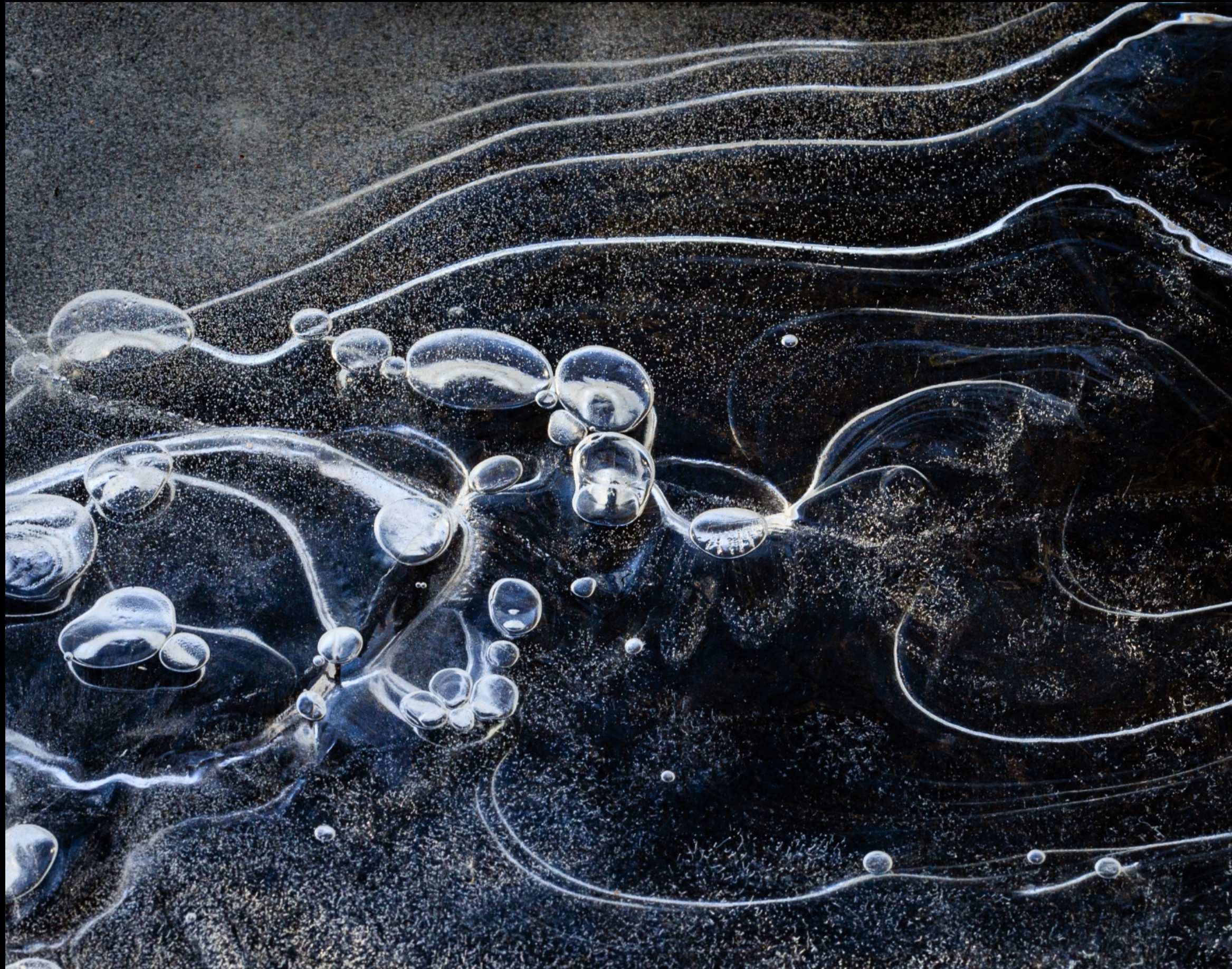
Laura Ferraguto, Ice Patterns, Little River