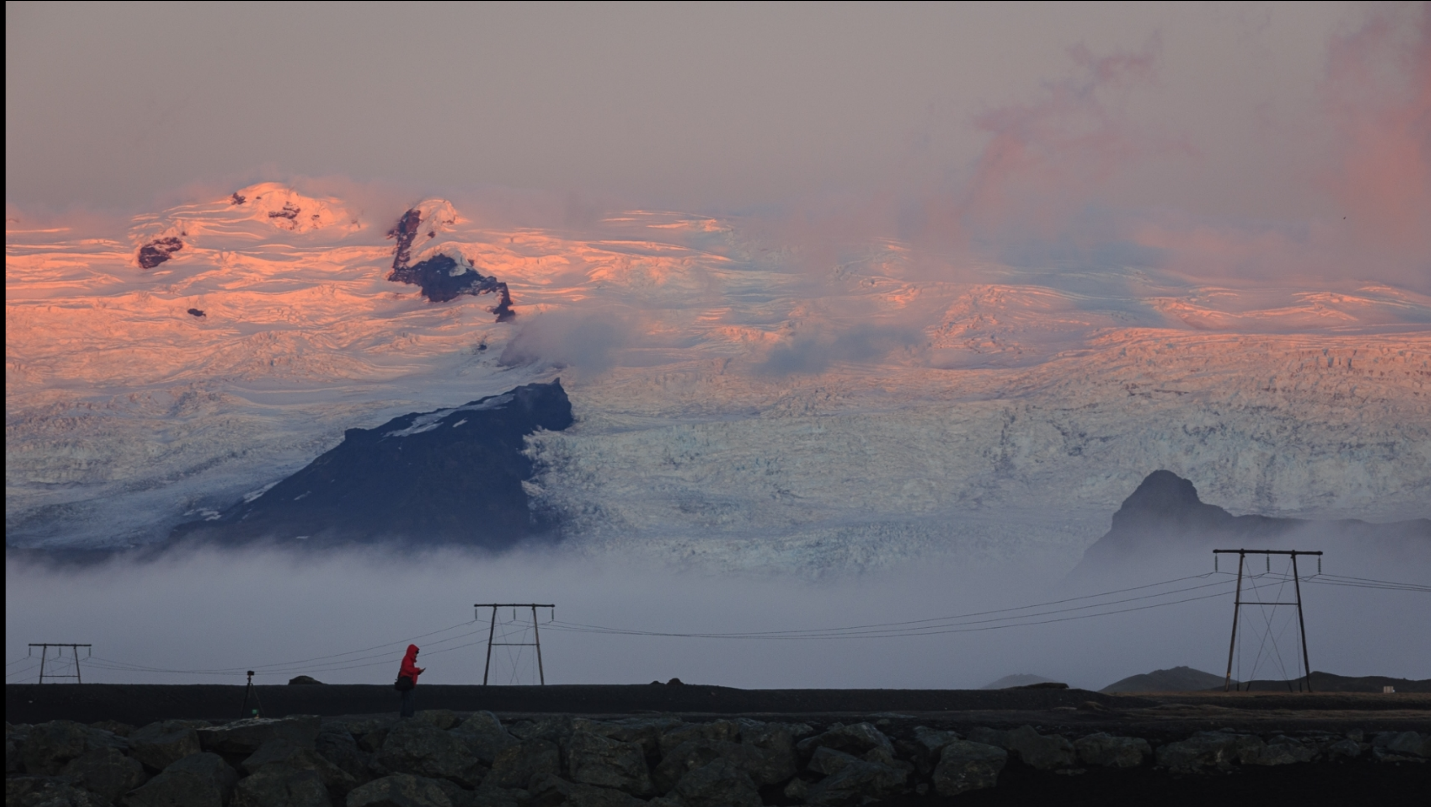
Glacier and Power Lines Bert Halstead